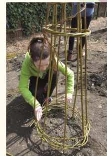
Willow weaving workshop

"The students stayed focused for the full three hours which is not something they would be able to do in the classroom. In addition to the numeracy and literacy there was a lot of additional learning and skill development going on." Cranford Community College